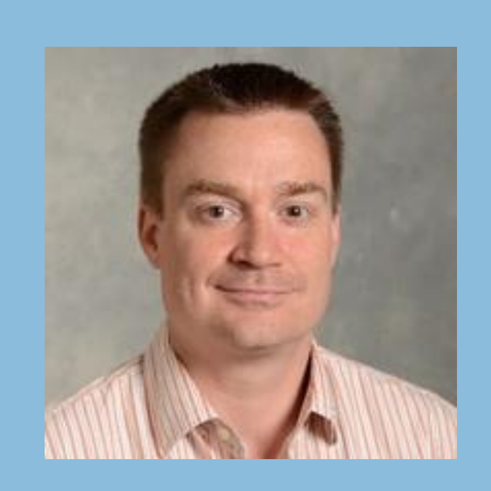
Quincy Wiley Wild Mike's Ultimate Pizza