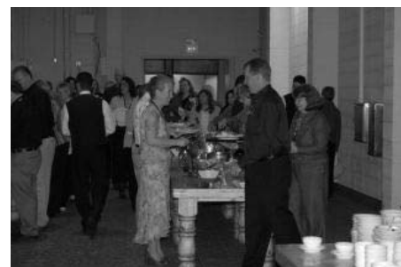
View of President's Reception